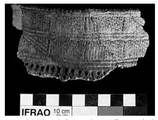
Figure 6. Madison Cord-impressed ware (Effigy Mound culture, A.D. 800-1050).

Mounds and Kekoskee phases. Broader contexts are implied by the remains of vessels that relate to northern Wisconsin and Minnesota peoples (e.g., St. Croix Stamped, Laurel Incised and Lake Nokomis Trailed). This implies that shamans, possibly, made pilgrimages from such northern areas to participate in performances of the Core Ritual. In turn, this implies that shamans returned to their homes, bringing with them knowledge that heightened their status among their peoples.