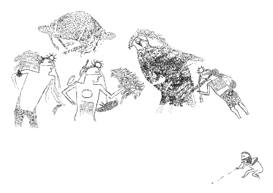
Figure 1. The Red Horn composition, A.D. 850-950.

of oxidation (and reduction); (2) all ashes and charcoal (perhaps representing the ingredients for the anthrosed) were carefully removed; and (3) a "cap" of pure anthrosed was made and laid down on the area that was burned. The Core Ritual includes feasting on deer meat (James Theler, personal communication; Reber 2003) and, occasionally, dog.