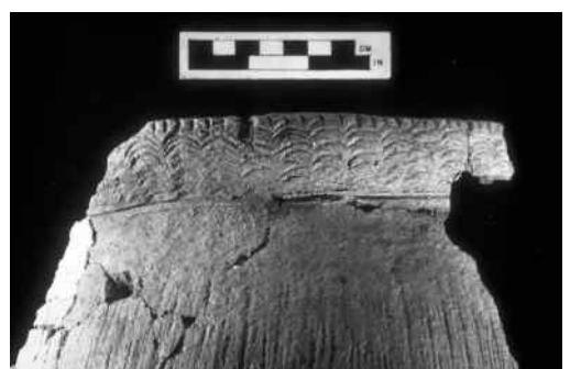
Figure 5. Marquette-stamped ware (early Millville phase, circa A.D. 200-300).