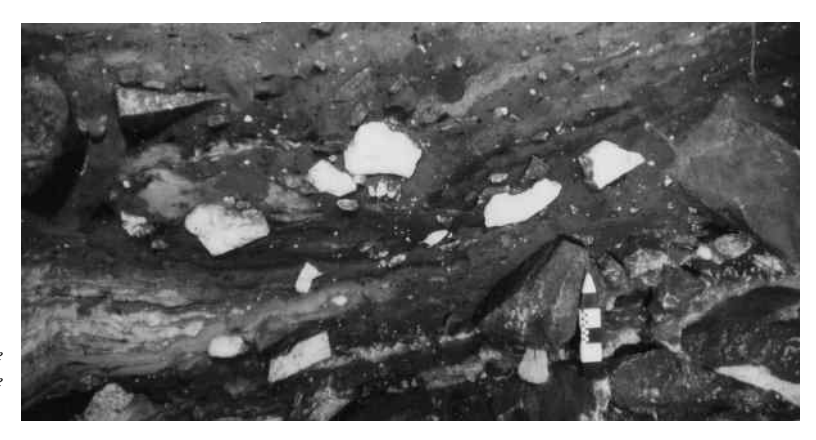
Figure 3. Stratigraphy of the south wall of S18W10. The scale is 30cm long.

Our best information about the regional context for the Core Ritual is the evidence of ceramics associated with the ritual, especially vessels from nearby sources. Among the ceramics are those relating to Millville, Lane Farm, Effigy