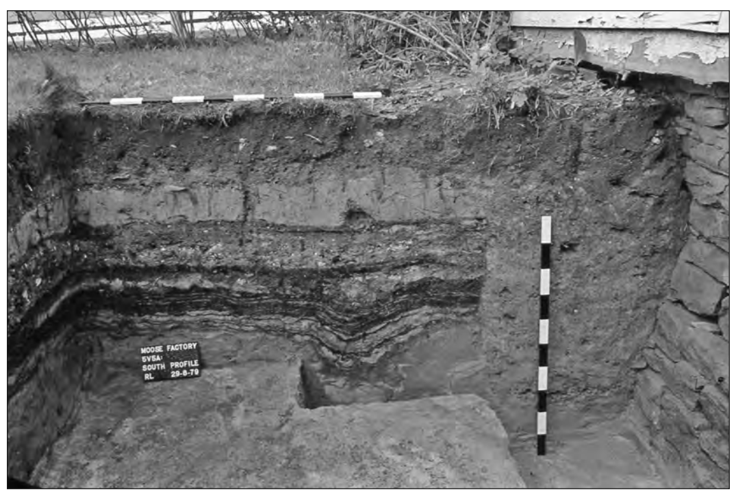
Figure 3. Sub-operation 5A, showing builder's trench up against Staff House.