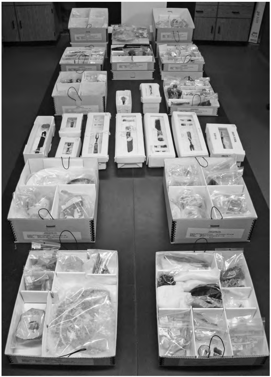
Figure 6. Completed Staff House reference resource collection.