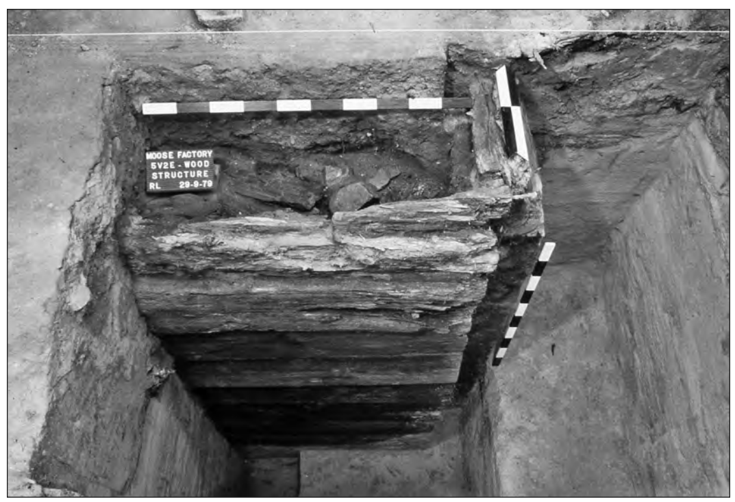
Figure 4. Sub-operation 2E inside the Staff House, illustrating basement well feature (Feature 2) with timber lining.