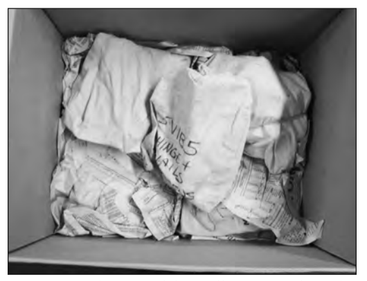
Figure 5. Rehousing of the Staff House artifact collection in progress. Note original packing materials.

Artifact material was identified for discard, conservation, or special storage needs. Discard items were identified based on the criteria of redundancy, condition, and cultural relevance. Through this process, the collection was sampled