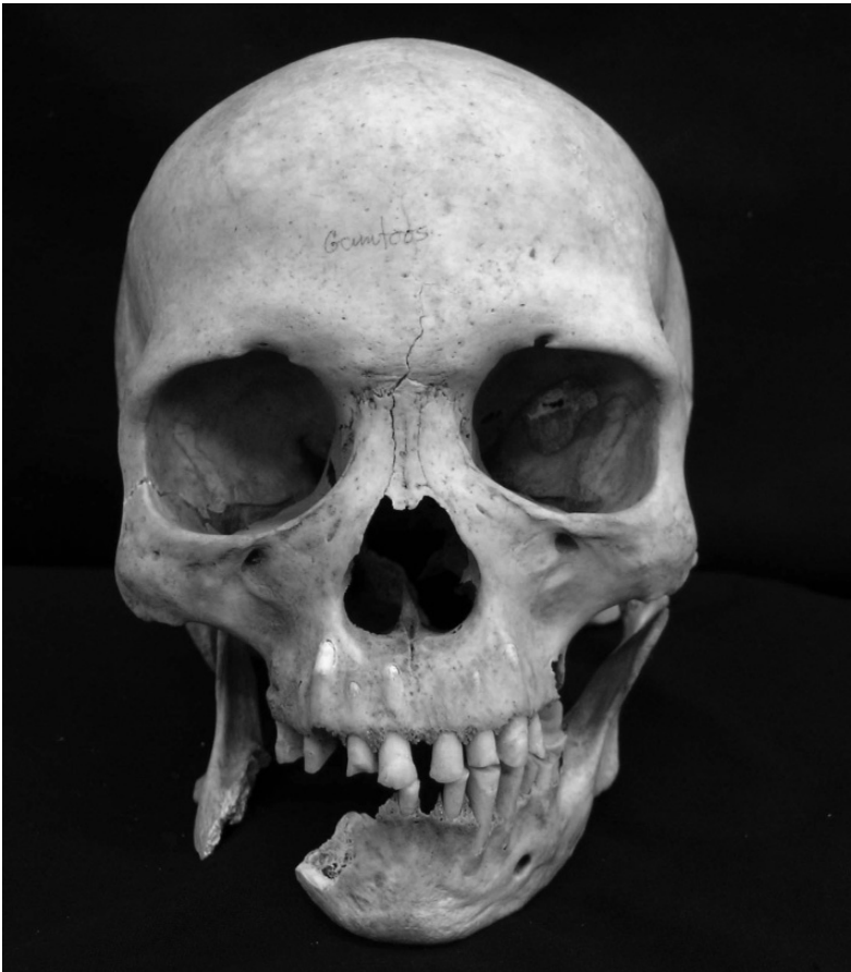
Figure 2. Facial view of Andrieskraal cranium and partial mandible. The general morphology is consistent with males of this population. Extensive dental wear is consistent with an age at death in mid- to late-adulthood.

values and greater variance during the fifth/fourth millennium before present, in both sexes and both biomes (Figure 4). Variation in femoral length does not correlate with dietary sources of protein, as reflected in stable isotope ( \delta^{13}\text{C} and \delta^{15}\text{N} ) values taken from bone collagen. There are some positive correlations between femoral head diameter and isotopic indicators of reliance on marine protein. While the nature of dietary protein does not explain the variance in stature, some type of nutritional explanation is most likely. The authors conclude that there must have been challenges of food sufficiency, among at least some communities. When femur lengths are plotted by ^{14}\text{C} date, it appears that the foraging populations “pulled out” of the stressful period during the third millennium, prior to the introduction of pastoralism. Femora are available from two of the adults affected by interpersonal violence. The reported