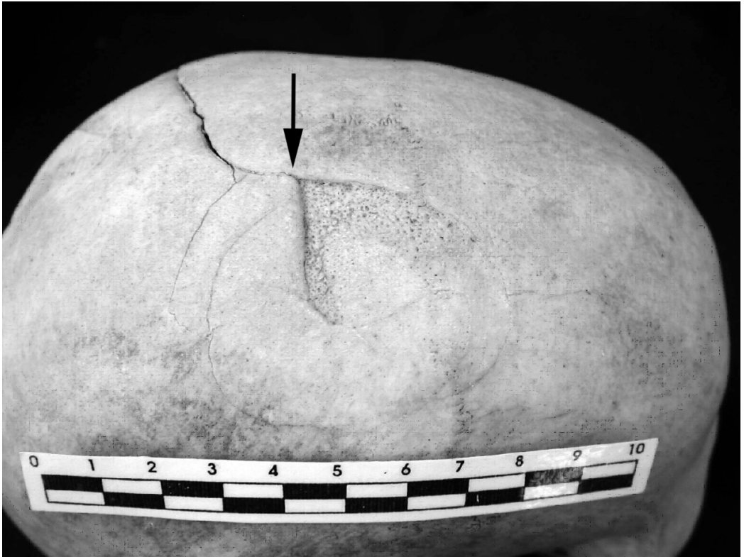
Figure 3. Lateral view of right side Andrieskraal cranium. Frontal is to the right. Major sutures are obliterated, consistent with advanced age. The focus of the blow is marked by an arrow. Curved fracture lines can be seen inferior to the arrow, and above the arrow the edges of the broken vault are smooth, consistent with bone healing but not knitting across the fracture.